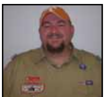
Ray Ezell Commissioner